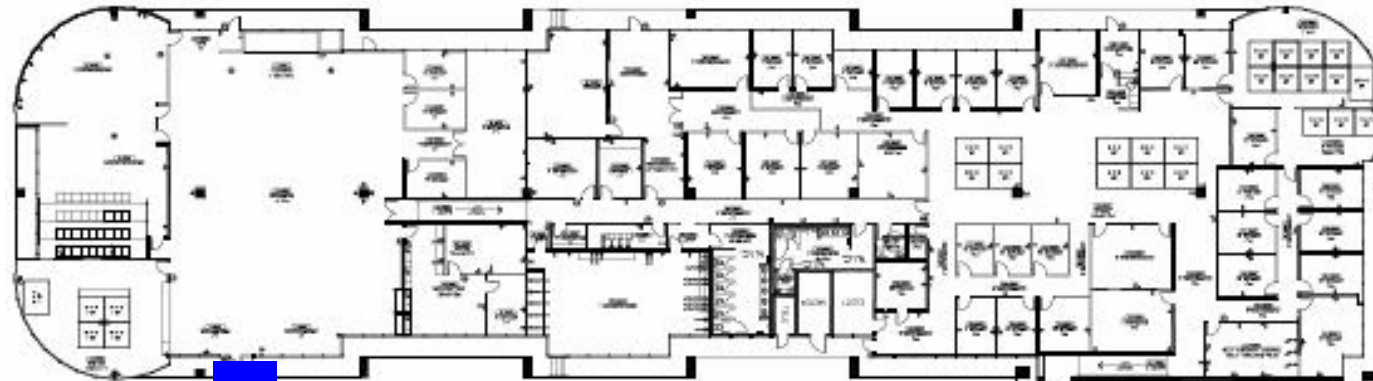
COUNCIL CHAMBERS, MUNICIPAL COURT, & BUSINESS LICENSES

7840 Roswell Road, Building 500 Sandy Springs, GA 30350 770-730-5600