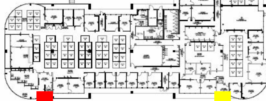
ZONING & PERMITS CODE ENFORCEMENT